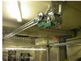
OVERHEAD GATE MOTORS