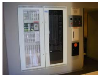
FIRE ALARM PANELS