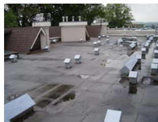
FLAT (LOW SLOPE) ROOFS

and overhaul of sump pumps. We have included some reference photographs of these types of assets.