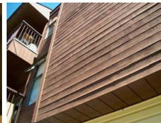
WALL AND WINDOW ASSEMBLIES