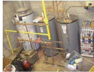
DOMESTIC WATER HEATERS

Some additional projects that may occur during this stage are: exterior sealant renewals, balcony membrane resurfacing, hallway carpeting replacement and sump pump overhauls. Included below are some reference photographs of a few of the assets that may require renewal during the 2nd lifecycle stage.